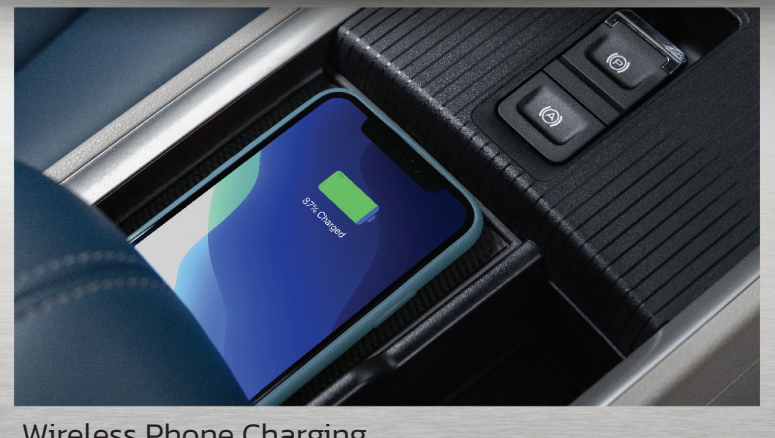
Wireless Phone Charging

ORA 03 is packed with hi-tech functions that will take you to a thrilling yet convenient driving experience-providing comfortable drive along with intelegent connectivity for enjoyable entertainment on the go.