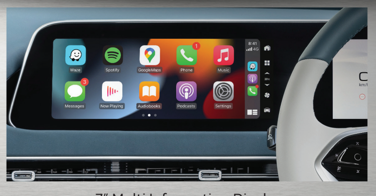
7" Multi Information Display 10.25" Audio Touch Screen Display