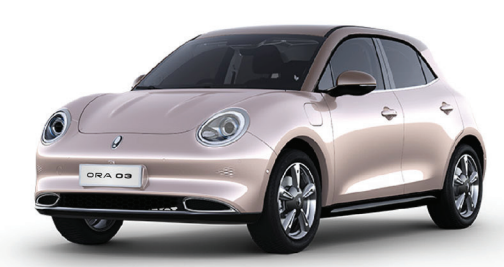
EM Beige/Wisdom Brown