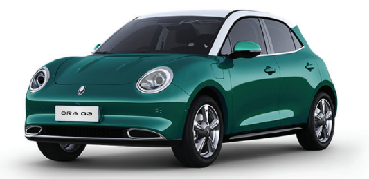
L5 Green/Hamilton White