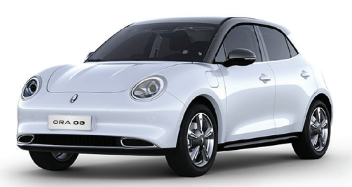
Hamilton White/Sun Black